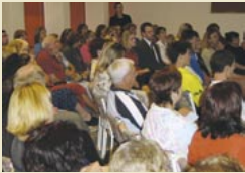
Locals learn about employment prospects at a workshop.

MORE than 80 locals attended a recent workshop to learn how to increase their employment prospects at Capricorn Coastal Village's proposed aged care facility. Scheduled for completion in 2005, the Churches of Christ aged care facility will generate approximately 220 jobs. The largest employment group will be care workers, who will work alongside enrolled and registered nurses. The facility will also need the support of kitchen, laundry, domestic, administration and maintenance staff. The workshop was conducted by Churches of Christ Learning and Development