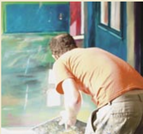
Encouraging local arts is an important initiative.

CAPRICORN Coastal Village stakeholders identified tourism, business development, community facilities, accessibility and education as key community development initiatives at a recent workshop hosted by Yanchep Sun City Pty Ltd (YSC). Over 50 key stakeholders attended the workshop which focused on the themes of creativity, endeavour, celebration and environment. Suggested initiatives included encouraging local arts, promoting eco-tourism, staging festivals, and providing a range of housing options.